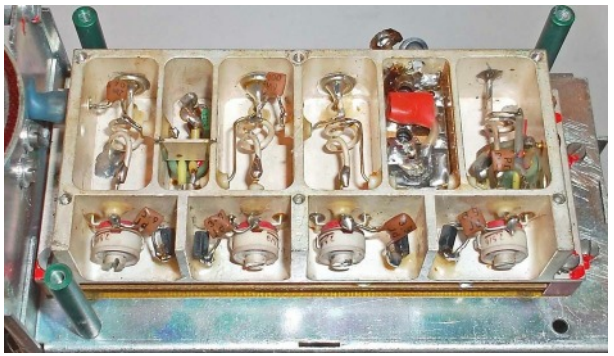
Down converter with cover removed.